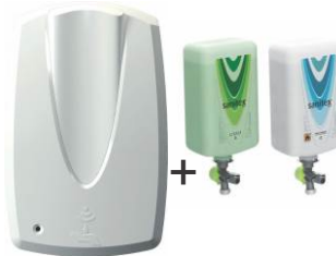
hand wash dispenser